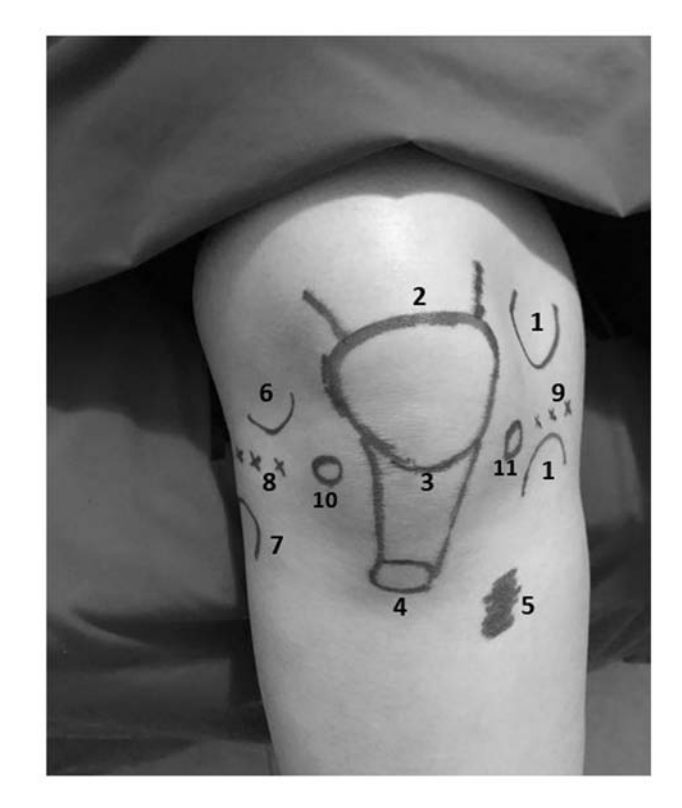
Figure 2. The figure shows schematically possible prolotherapy points in a healthy model. The injection sites used for hypertonic dextrose prolotherapy. 1, proximal and distal medial collateral ligament; 2, quadriceps tendon region of the patella upper edge; 3, proximal region of the patellar tendon; 4, distal of the patellar tendon; 5, tendon region of pes anserine; 6, proximal lateral collateral ligament; 7, distal lateral collateral ligament; 8, lateral coronary ligament; 9, medial coronary ligament; 10 and 11, intra-articular injection sites.

The power of the study was calculated using the G*Power 3.1.9.4 program after the study. In the evaluation using the difference between two independent means, the power of the study was found to be 99%. The effect size was calculated as 1.26 using the post-treatment VAS parameter.