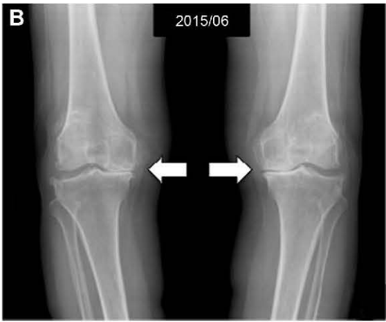
Figure 1 Standard weight-bearing knee X-rays of a 77-year-old female before (A) and 8 months after (B) one course of intra-articular PRP in association with HA injection, showing the increase in medial joint space (white arrows). Abbreviations: HA, hyaluronic acid; PRP, platelet-rich plasma.