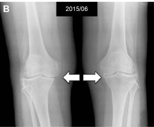
Figure 2 Standard weight-bearing knee X-rays of a 69-year-old female before (A) and 15 months after (B) one course of intra-articular PRP in association with HA injection, showing significant improvement in the narrowing joint space (white arrows). Abbreviations: HA, hyaluronic acid; PRP, platelet-rich plasma.