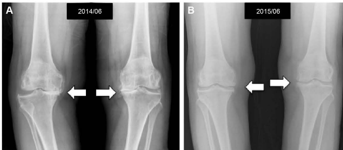
Figure 3 Standard weight-bearing knee X-rays of a 76-year-old female before (A) and 1 year after (B) two courses of intra-articular PRP in association with HA injection, showing more significant bone spur growth and the cartilage remains at a healthy size with the normal joint space (white arrows).

Abbreviations: HA, hyaluronic acid; PRP, platelet-rich plasma.