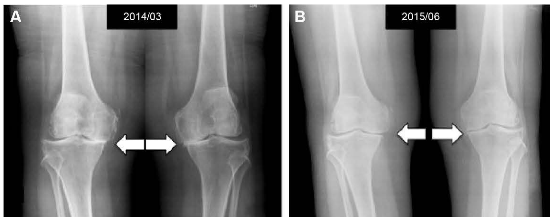
Figure 2 Standard weight-bearing knee X-rays of a 69-year-old female before (A) and 15 months after (B) one course of intra-articular PRP in association with HA injection, showing significant improvement in the narrowing joint space (white arrows). Abbreviations: HA, hyaluronic acid; PRP, platelet-rich plasma.

She received PRP injection, followed by 3 weeks of intra-articular HA (Ostenil®) injection course for bilateral knees separately (once a week on bilateral knees, a total of 3 weeks) in March 2014. The symptoms were improving but still she had tenderness and impaired walking endurance. Therefore, she received another course of PRP plus HA (Ostenil®) injection in August 2014. The tenderness over medial knee and walking endurance were improving but still she had no complete relief, with VAS being 50 mm. She was followed up two times in the clinic for intra-articular HA (Ostenil®) injection in December 2014. PRP injection once over bilateral knees in January 2015 was also arranged. She mentioned that the knee pain was completely relieved after the aforementioned treatment. However, the follow-up standard weight-bearing