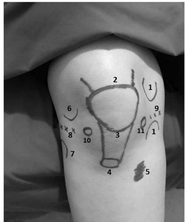
Figure 2. The figure shows schematically possible prolotherapy points in a healthy model. The injection sites used for hypertonic dextrose prolotherapy. 1, proximal and distal medial collateral ligament; 2, quadriceps tendon region of the patella upper edge; 3, proximal region of the patellar tendon; 4, distal of the patellar tendon; 5, tendon region of pes anserine; 6, proximal lateral collateral ligament; 7, distal lateral collateral ligament; 8, lateral coronary ligament; 9, medial coronary ligament; 10 and 11, intra-articular injection sites.

The power of the study was calculated using the G*Power 3.1.9.4 program after the study. In the evaluation using the difference between two independent means, the power of the study was found to be 99%. The effect size was calculated as 1.26 using the post-treatment VAS parameter.